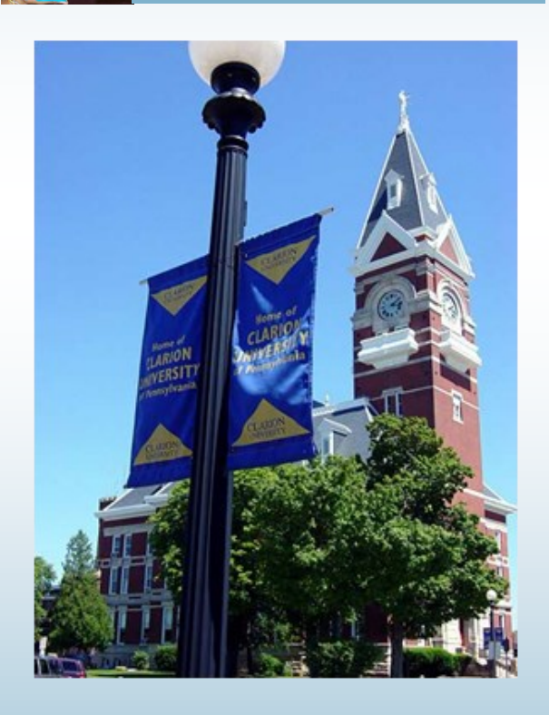
Office of Social Equity Fostering an Inclusive Environment