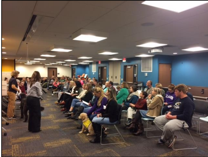
Top Photo: Audience participating in the Canine Companions for Independence panel