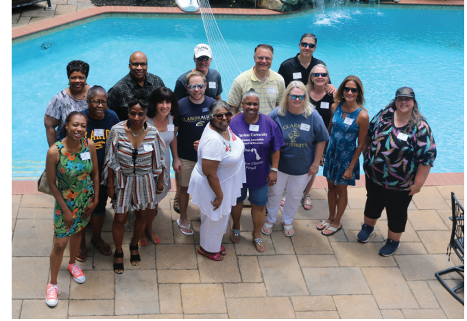
Alumni in the Washington, D.C., area had a taste of the iconic Bob's Sub during "Build Your Own Bob's Sub Day."